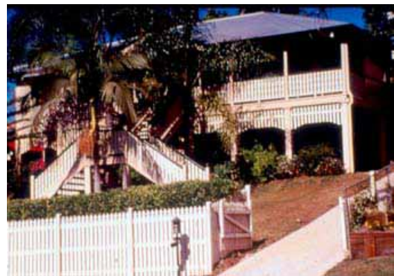
Figure 2: For suspended timber floors, termite shields and routine inspections provide adequate protection.