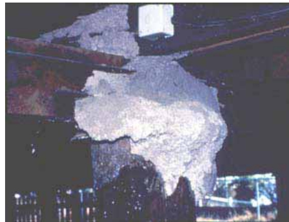
Figure 1: Physical barrier (termite shield) bridged by subterranean termites.

When resistant or pre-treated timber is used in building construction, it is generally confined to structural elements such as