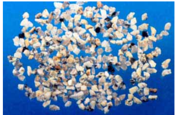
Figure 4: Graded stone barriers consist of compacted rock particles.

The concrete should be placed, finished and cured using the procedures recommended by