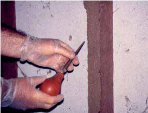
Figure 6: Toxic dust can destroy the termite colony.

Dusting is ineffective against some species of termite, for example Coptotermes frenchi , which tends to avoid disturbed areas.