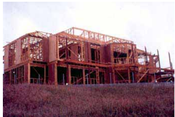
Figure 5: With slab-on-ground construction, many areas are inaccessible for inspection.

the Cement and Concrete Association of Australia to minimise cracks and voids. Control joints and slab penetrations can be protected by barriers such as stainless steel mesh or graded stone. These barriers also can be installed under the whole of the slab. Exposed slab edges provide ready detection of termite entry.