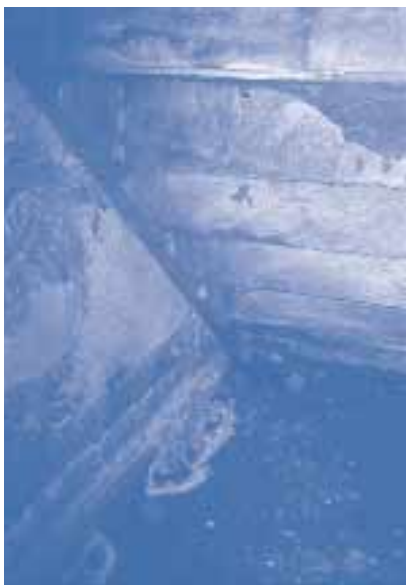
An example of dry rot or fungal decay under a staircase showing the fruit bodies that appear when the fungus is mature and the water-conducting fungal strands.

Although fungal spores are common in the air they cannot develop and attack wood unless it has a moisture content in excess of about 20 per cent by weight. Dry wood will not rot. Preventing fungal attack is simply a matter of keeping wood relatively dry. This, of course, is easier said than done; some timbers, such as fence posts,