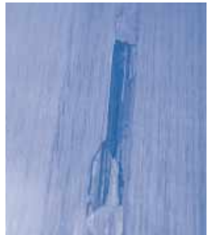
Subterranean termite damage in floorboards

More significant are several introduced species, particularly the West Indian termite which has been found in several places between Sydney and Brisbane. Whereas subterranean termites produce a dusty frass, drywood termites have distinctive faecal pellets. They are usually treated by fumigating the whole building with methyl bromide, a procedure requiring specialist advice and skills.