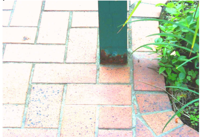
Severe corrosion in metal bracket supporting deck post