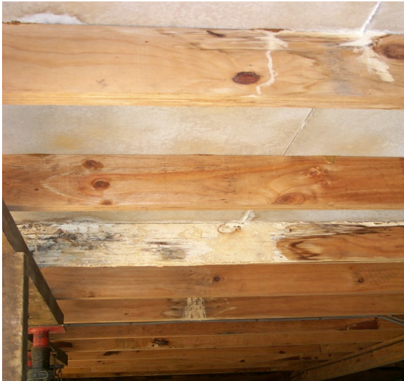
Decay in joists under a supposedly “waterproof” deck