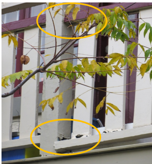
Unlike the above example make sure handrail and balustrade connections are secure