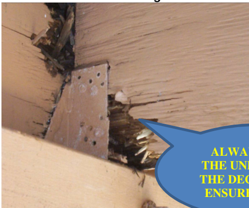
Decayed deck joist and fascia – deck should not be used as dangerous

ALWAYS CHECK THE UNDERSIDE OF THE DECK FIRST TO ENSURE IT IS SAFE