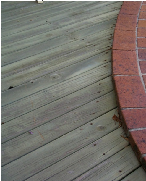
Corrosion of galvanised nails close to swimming pool