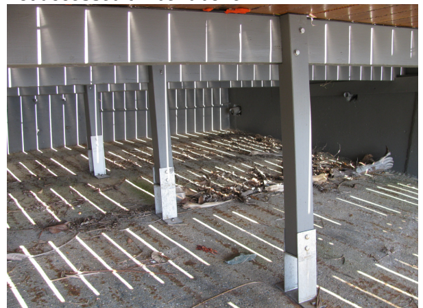
Check the base of posts to ensure termites have not accessed timber above.

Termite track ('mud tunnel') on post. Termites attacking timber deck above