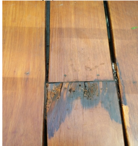
Check for decay at ends of decking boards. In this example, the board is not safe.