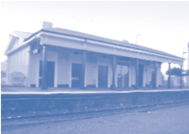
Williamstown Railway Station is a well restored and maintained public building.