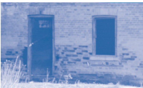
Poor maintenance has resulted in damage and deterioration to this building.