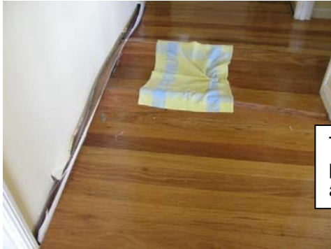
This inundated T&G floor over particleboard tented about 1 week after the water receded.

The flooring may continue to swell or expand across the boards for a period of time even after the water has subsided as moisture moves deeper into the timber. After cleaning, assess the extent of swelling and or tenting of boards (lifting off the supports). Check to see if there is still clearance between the edges of boards and the bottom plates of walls (usually under the skirting board) and to see if the flooring has expanded and started to push wall frames out at the bottom. If necessary relieve the pressure on walls by removing or cutting out perimeter boards. Eliminate any trip hazards that may have arisen due to tenting of boards or lifting of nails etc.