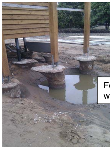
Footings scoured out by fast flowing water

NOTE: Where fast flowing water has impacted on the dwelling, joists and bearers may have shifted/twisted and walls and windows may be out of square etc. Any excessive misalignment should be corrected before new cladding or lining is installed.