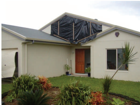
Failure of a gable end wall allowing strong wind and rain water into the house

The gable end walls of a house can take a tremendous pounding during a cyclone. If not properly braced and anchored, they can collapse and cause significant damage to the house. In general, the taller the gable end triangle, the greater the risk of damage. However, gable end walls are usually easy to strengthen through bracing, if necessary.