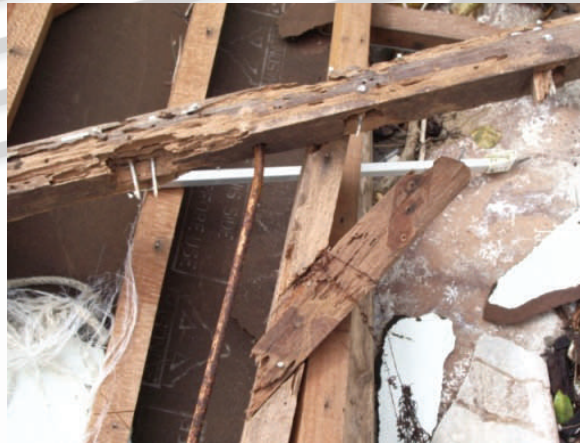
Termite attack to timber

Cyclonic regions within Australia are often areas of high termite risk and therefore, timbers in your house may be susceptible to termite attack. Timber protection systems require on-going inspection and maintenance to ensure they provide an effective on-going barrier to termite attack. If it is found that termites have attacked timbers in your house, expert advice should be sought on whether the timber needs to be replaced and to repair the termite barrier.