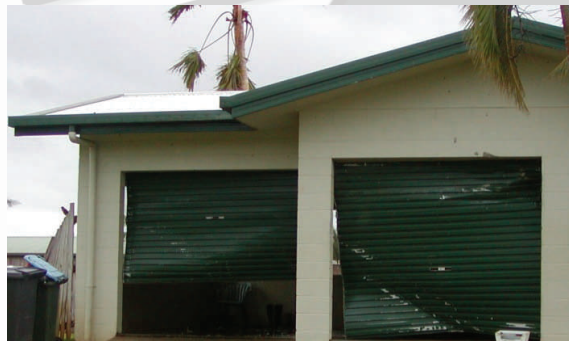
Damage to garage doors.

It is common to see garage doors fail when they are pushed in or out by strong winds.