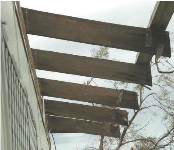
Corroded batten straps contributing to roof failure

You should check for signs of corrosion around the house. This is the time to look inside the roof space for corrosion of metal roof coverings, metal battens, batten straps, fixing bolts, fixing plates, screws, nails, etc. Note that the risk of corrosion is particularly relevant in areas near the coast. Metal components showing signs of corrosion may need replacing.