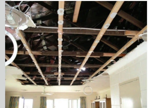
Damage to ceiling due to water ingress

Damage to eaves lining by strong winds is another common cause of damage to houses. This can happen due to inadequate fixing or support for the eaves lining or because the lining spans too far. Eaves lining damage allows rain and wind to blow into the roof space, which may result in damage to ceiling and wall lining inside your house.