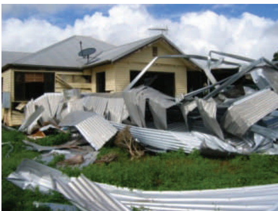
Flying debris resting in front of a house

Other outdoor objects and equipment such as air conditioning equipment, hot water tanks, swimming pool equipment, solar water panels, satellite dishes, antennas and similar objects may be blown around in a cyclone and can become flying debris that could impact your house or other houses in your neighborhood. You should ensure that all equipment is not loose and that it is properly fixed.